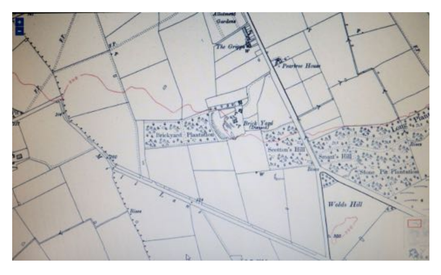
OS Map 1915