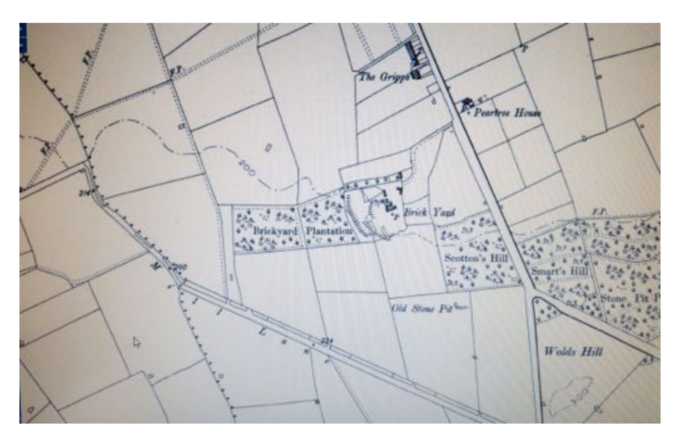
OS Map 1899